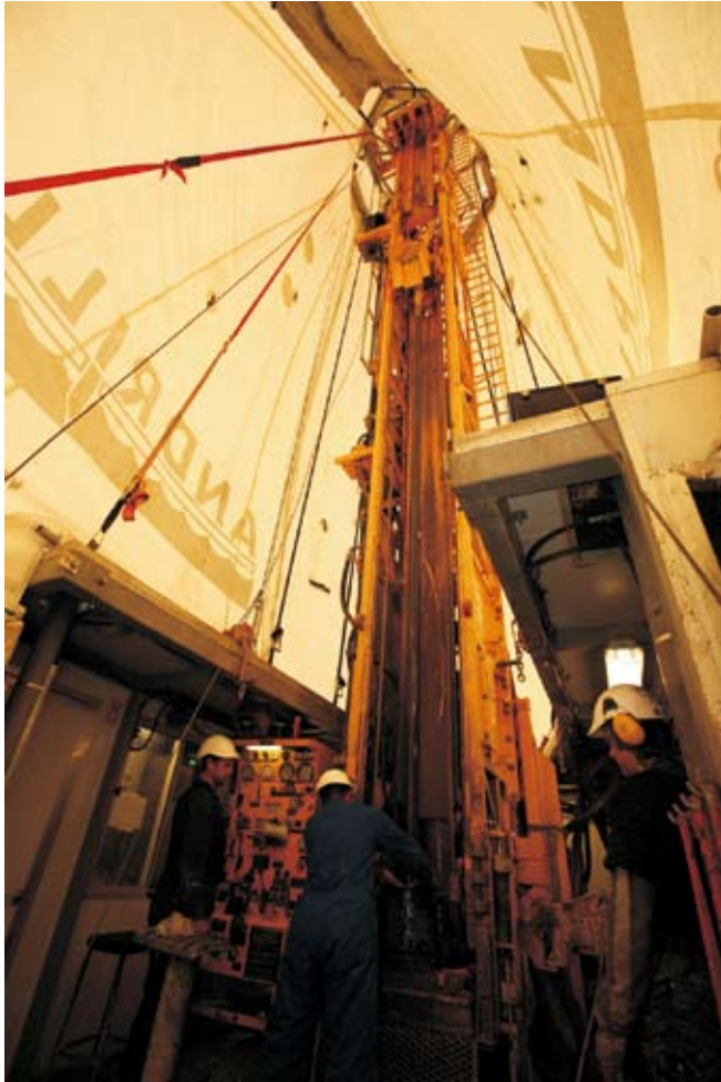
Figure 5. Drilling operations under the ANDRILL drill-rig canopy.

Nebraska-Lincoln. Scientific studies are jointly supported by the U.S. National Science Foundation, NZ Foundation for Research, the Italian Antarctic Research Program, the German Science Foundation, and the Alfred Wegener Institute. For more information, please visit the ANDRILL website at http://andrill.org .