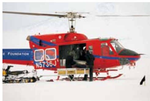
Figure 3. ANDRILL sediment cores were flown by helicopter daily from the drillsite to the Crary Science and Engineering Center at McMurdo Station.

Programs like ANDRILL can help constraining uncertainties about the future behavior of Antarctic ice sheets and resultant sea-level change. These stratigraphic records will be used to determine the behavior of ancient ice sheets and to better understand the factors driving past ice sheet, ice shelf, and sea-ice growth and decay. This knowledge will enhance our