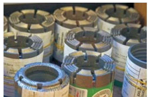
Figure 4. Diamond-impregnated drilling bits enable the ANDRILL drilling system to recover high-quality core, with up to 98% core recovery through glacial and glaci-marine sediments.