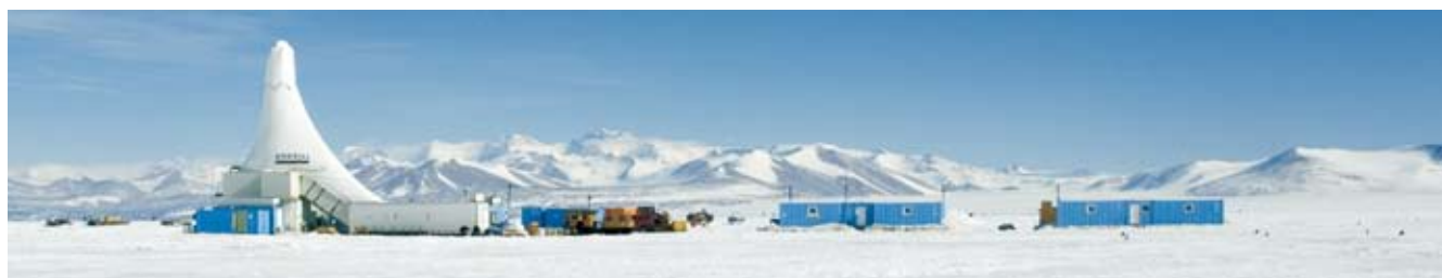
Figure 1. Panoramic image of the ANDRILL drilling rig and science laboratories in Southern McMurdo Sound during late 2007, operating from a 8.4-meter-thick sea-ice platform. Transantarctic Mountains are visible in the background.

In addition to the 600-m-thick middle Miocene interval (800–223 mbsf), the SMS Project AND-2A drill core also recovered a lower Miocene interval (1138.54 up to c. 800 mbsf) of an expanded section through an interval previously recovered during the Cape Roberts Project and an upper Pliocene to Recent interval (223 mbsf to 0.0 mbsf) that is thinner but correlative to parts of the Upper Neogene section recovered by the ANDRILL MIS Project in drill core AND-1B. Comprising abundant volcanic clasts and tephra layers, also provide the materials to document the 20-million-year evolution of the McMurdo Volcanic Province including several previously unknown explosive volcanic events.